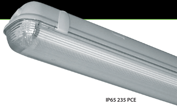
IP65 235 PCE